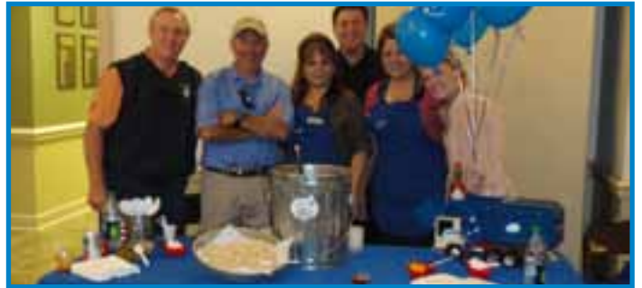
Advanced Disposal employees from the Macon office stand proudly behind their “Trash Can Chili.”