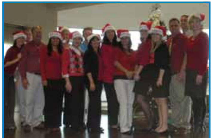
Advanced Disposal's corporate office wishes everyone a happy holiday season and a cheerful new year!