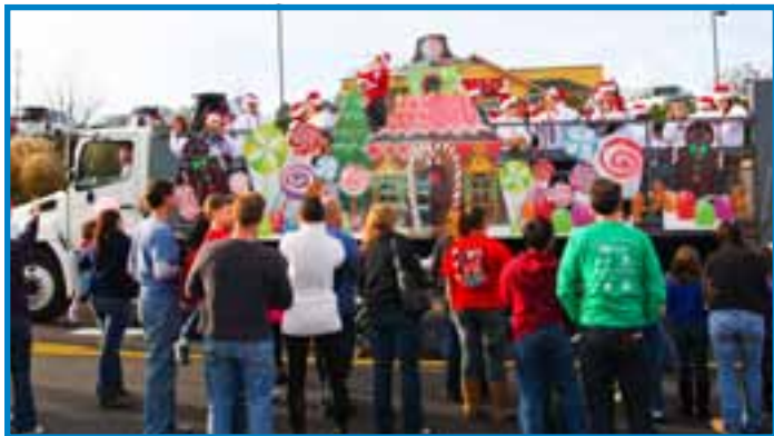
Advanced Disposal-Atlanta North and Eagle Point Landfill employees renovated a truck into Santa's Sugar Shack for the Annual Cumming Forsyth County Chamber of Commerce Christmas Parade.

The Columbia team also participated in the South Congaree, South Carolina, Christmas Parade and Holiday Festival by providing in-kind services and event boxes. About 3,000 area residents attended the event.